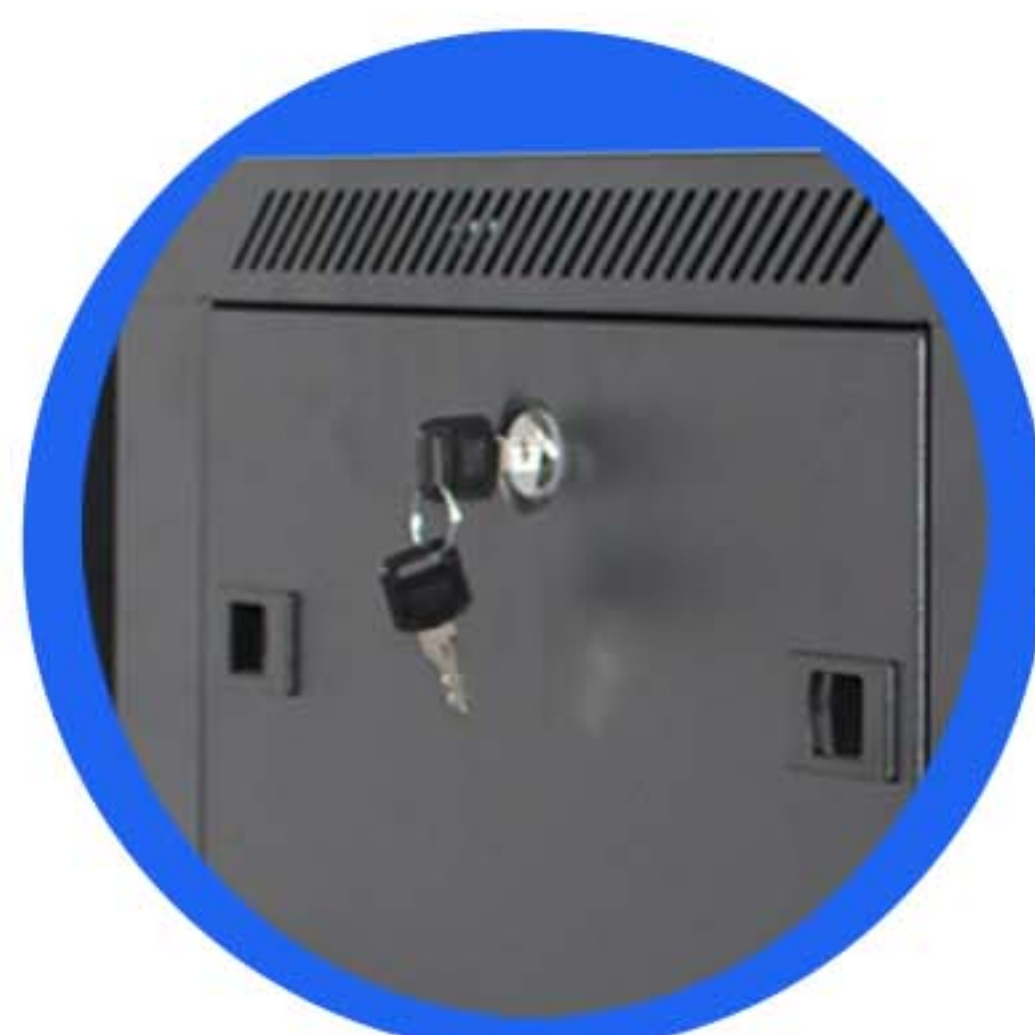
Removable side panel w/ locking system