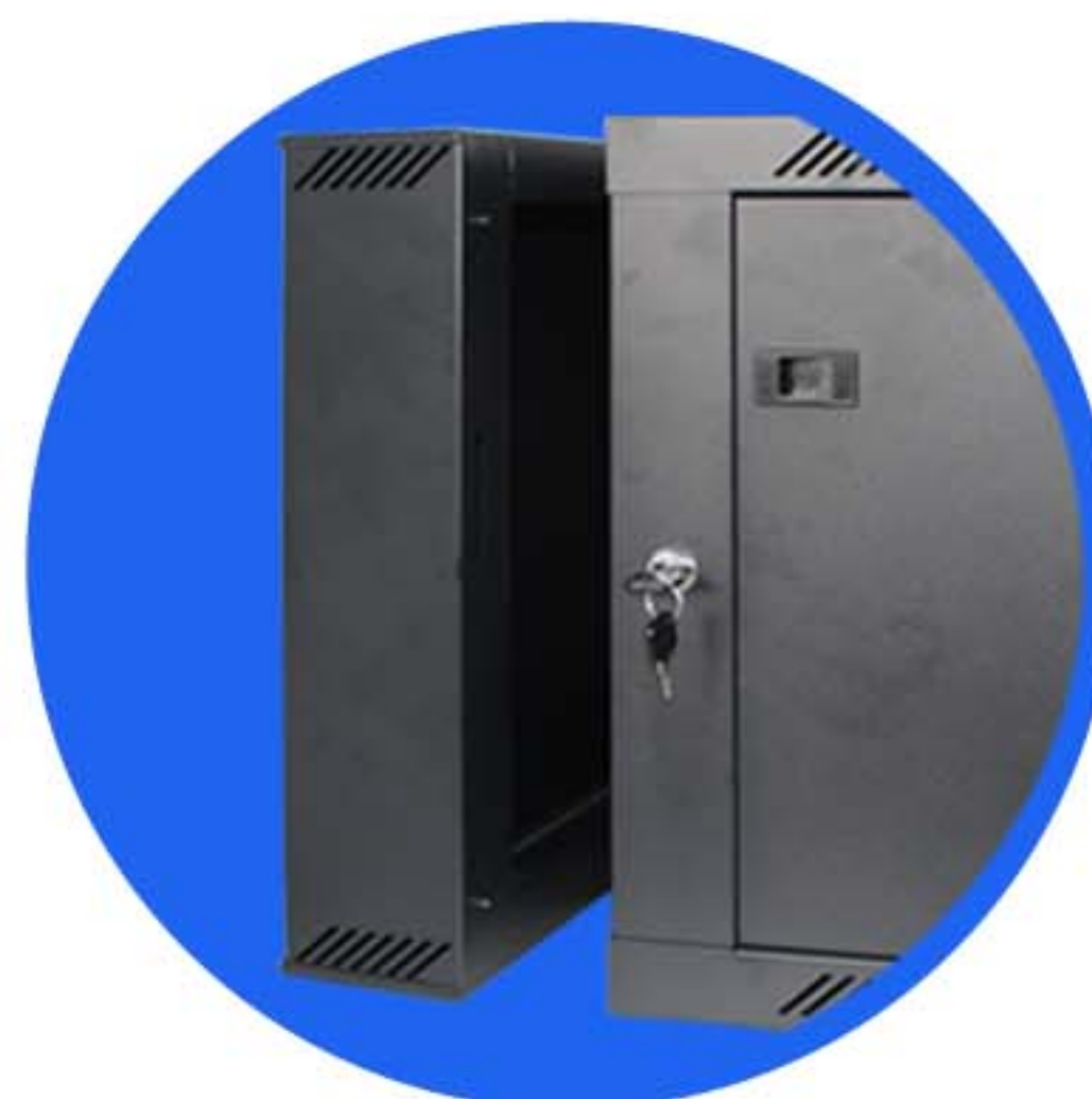
Double door Ease installation