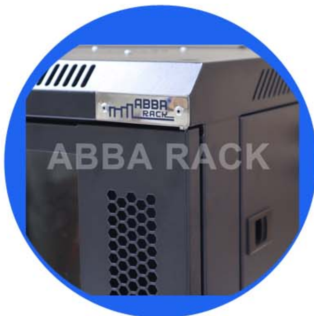
Acrylic front door Top & bottom vented