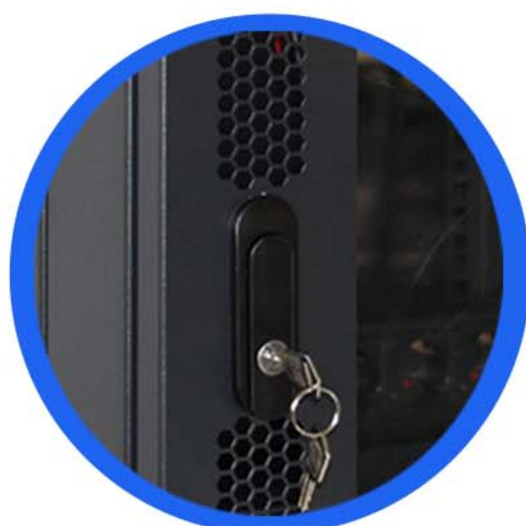
Handle front door w/ Hexagon Vented