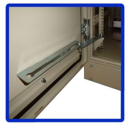
Door Switch + PE Foam