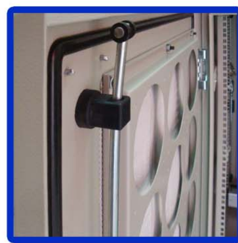
Door Gasket & Lock