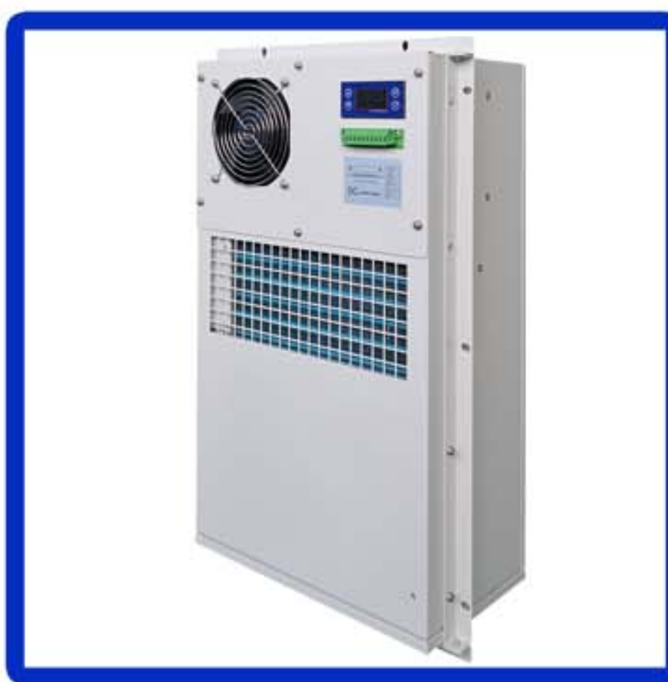
Air Conditioner AC/DC