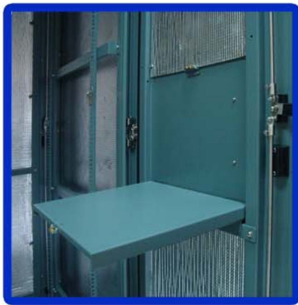
Laptop & Paper Patch